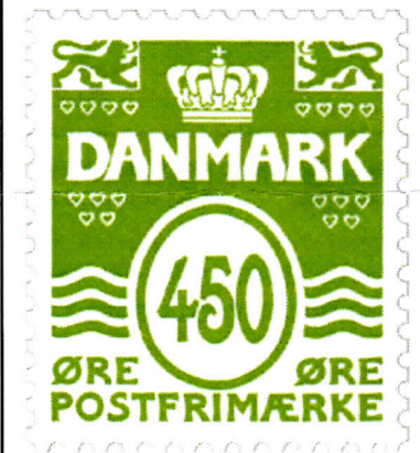
2005: Intaglio (re-engraved) Restored to original design.