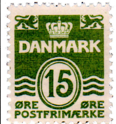
1933 – 1992: Intaglio Quadrilled background with no hearts and an extra ring around the denomination.