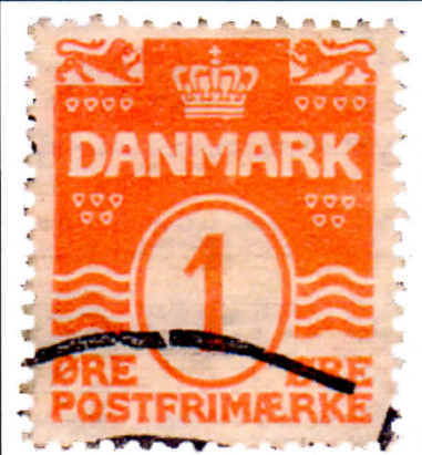
1905 – 1930: Letterpress The original style with solid background and 18 hearts.

We wish them all a happy 100th anniversary, may they continue for another 100 years.